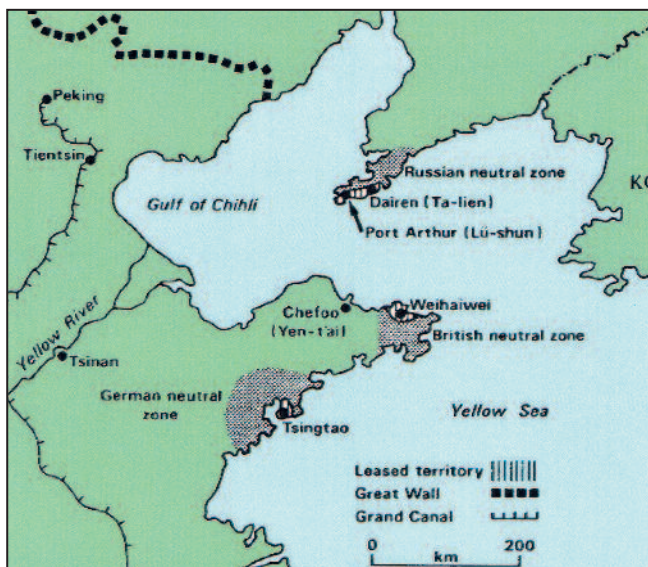
Map showing location of British naval station at Weihaiwei (Port Edward) in relation to the German treaty port at Tsingtao and the Russian treaty port at Port Arthur.

The British naval presence in the Far East was known collectively as the China Station. In December 1941 it merged with the East Indies Station to form the Eastern Fleet. The