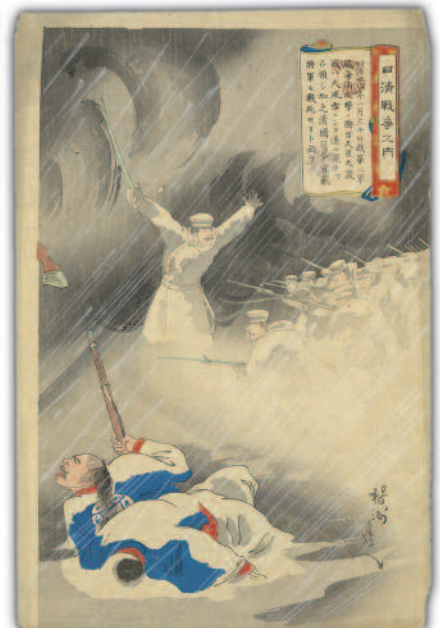
Sino-Japanese War, 1894-1895. Woodcut triptych shows Japanese troops surprising Chinese soldiers at Weihaiwei and the death of a Chinese officer on horseback leading his troops into battle. Artist: Chikanobu Hashimoto (1838-1912).