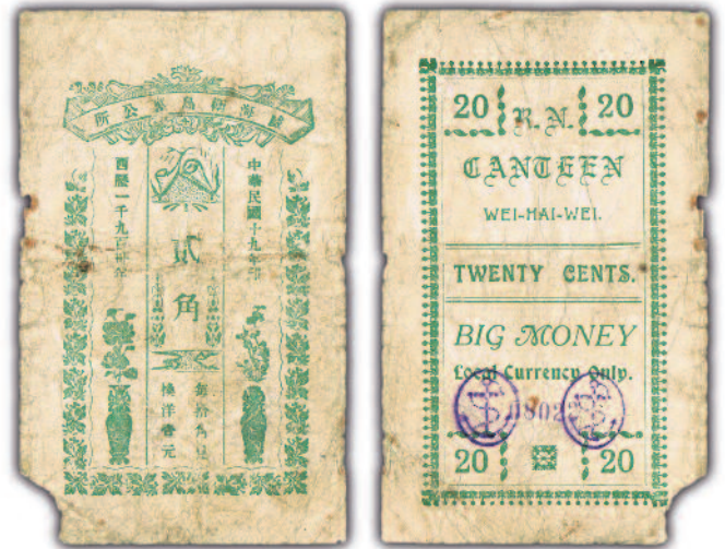
Royal Navy Canteen chit used at Weihaiwei between 1898 and 1930 Front in English, back in Chinese

China Station had three ports, Singapore, Hong Kong and Weihaiwei, the last of which was known as the summer rest and relaxation port because of its excellent climate. It was to this destination that many ships sailed, when the humidity of Singapore and Hong Kong became too oppressive. The British naval station was not alone however, Germany had its treaty port at nearby Tsingtao and the Russians had Port Arthur across the Chihli Gulf.