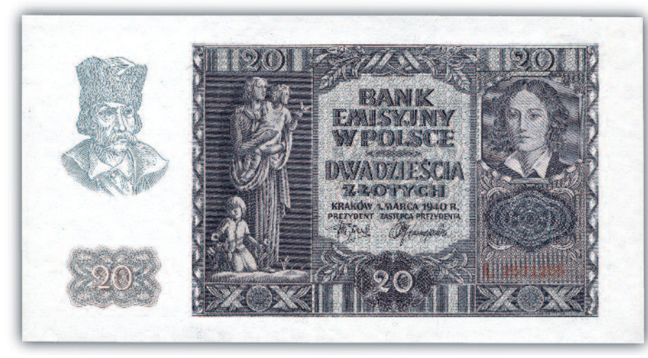
Poland 20 Zlotych SCWPM 95 1940 Bank Emisyjny w Polsce. Valid in the ghetto

The post office in the ghetto was run by the Judenrat (Jewish Council) but the money derived from the sale of postal items was sent to the main post office in Warsaw which was under German control. There were eight yellow post boxes situated within the borders administered by the Jewish administration, which was responsible for the collection of outgoing mail between four and six pm,