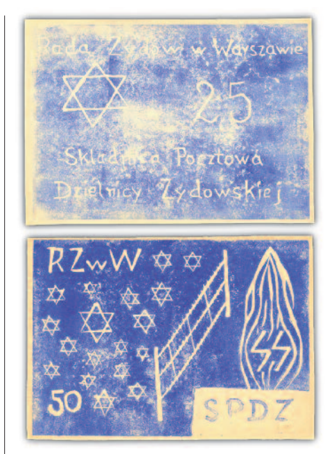
Warsaw Ghetto unissued proofs, 25 with issuer in full and 50 with significant symbolism

The latest mention of these notes is in Feller's catalogue Silent Witnesses where they are given full examination, and various points of view are discussed. The four lowest denominations all have the initials RZwW and SPDZ, a Star of David and the denomination. None of them indicate a unit of currency and it is interesting that the denominations are within 5 of the next higher except for the highest 50. The notes for the two higher denominations are much larger, the 25 denomination has the initials RZwW