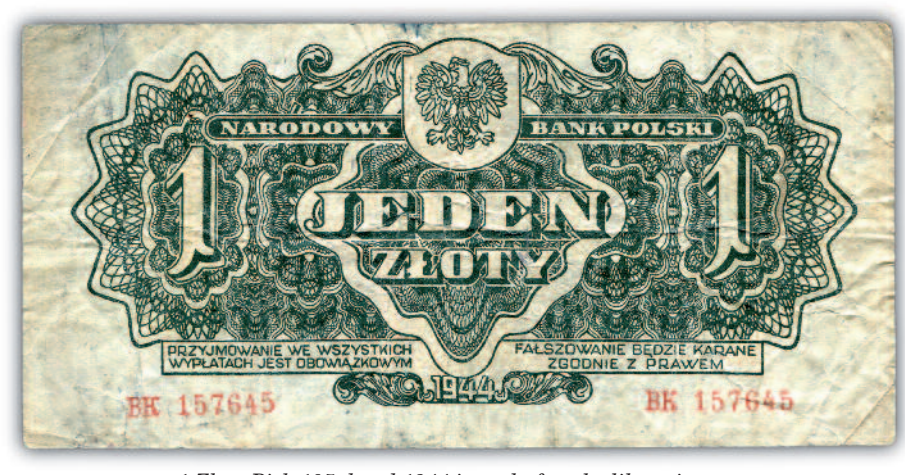
1 Zlotv Pick 105 dated 1944 issued after the liberation. Few Polish Jews were alive to see this currency of freedom.

There have been other over-stamped Polish notes on the denominations of the 1940 issues (Pick 91, 93, 94 and 96). The overprints say "Braterstwo Broni Anglii Ameryki Polski Niech Zyje" (long live the Anglo-American-Polish brotherhood in